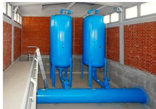
Figure 2 Two vertical air receivers