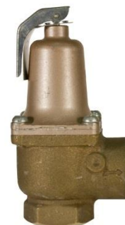
Figure 3 Relief valve that incorporates a lever to test it